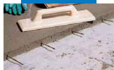
Detail of a Topcem screed with reinforcement rods