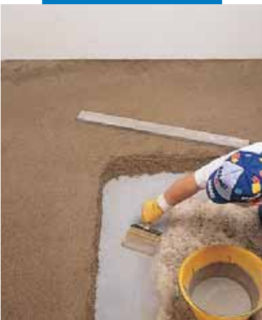
Spreading the anchoring slurry for bonded Topcem screeds