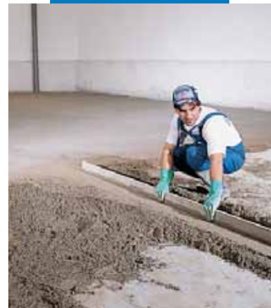
Preparing a levelling strip

Temperature when in use: from -30°C to +90°C