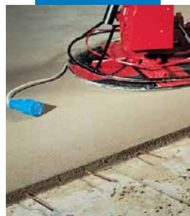
Power floating the surface of a Topcem screed