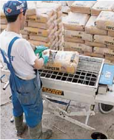
Mixing Topcem in a mini-batcher

The product complies with the conditions of Annex XVII to Regulation (EC) N° 1907/2006 (REACH), item 47.