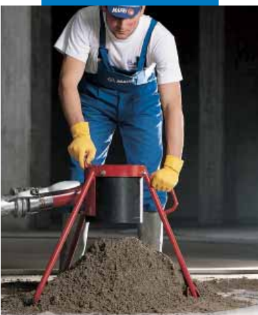
Batching a Topcem mix