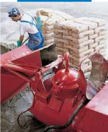
Mixing Topcem with an automatic pumping unit